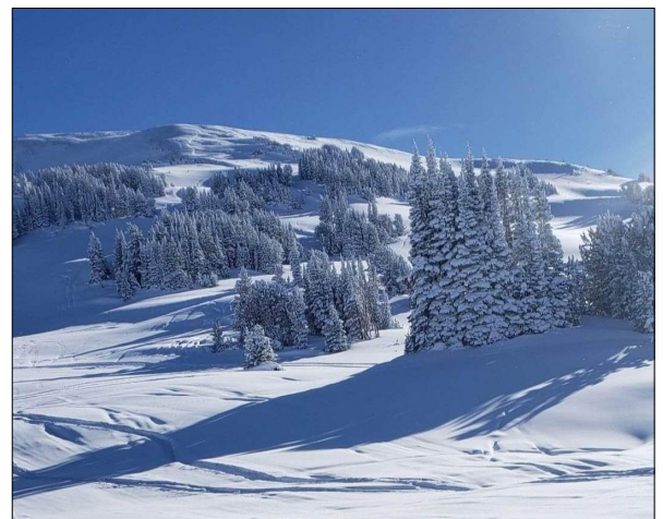
Cooke City MT sledding, Rowdy & Kristen's stomping grounds!