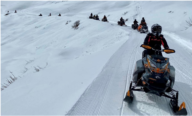
Vallecito Ride Group