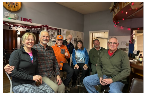
SJS members enjoying S&W in Hotchkiss