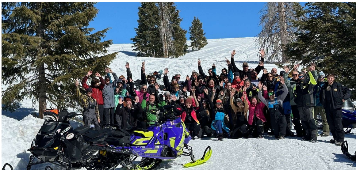
Poker Run Attendees!