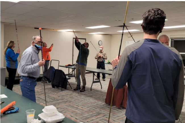
Probe Pole Practice—basic avalanche & safety class