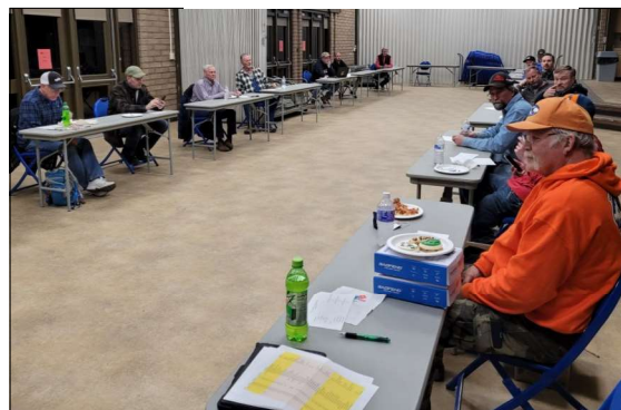
March SJS Club meeting @ La Plata Fairgrounds