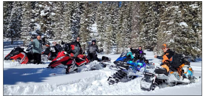
Mid-week ride March 17 at Mancos