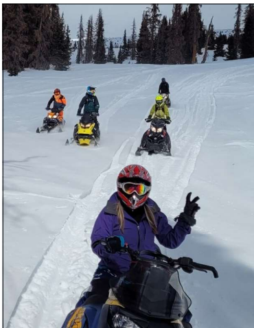
SJS members at Lemon