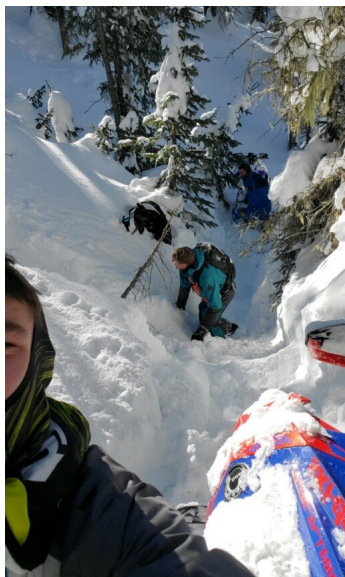
Advanced Ride Havoc—Middle Mtn