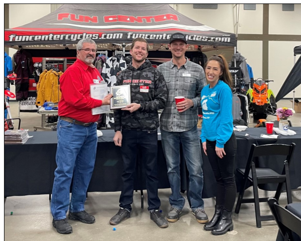
Fun Center, Snowmobile Dealer of the Year