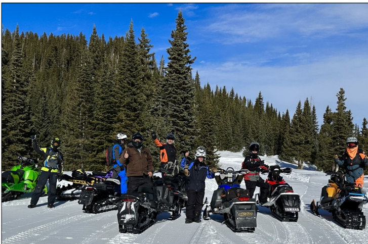
Group Pic at Windy Gap