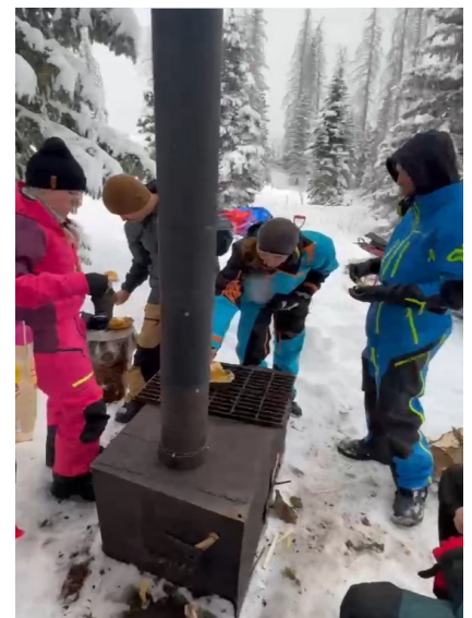
Christmas Eve at the Barrel—Middle Mtn