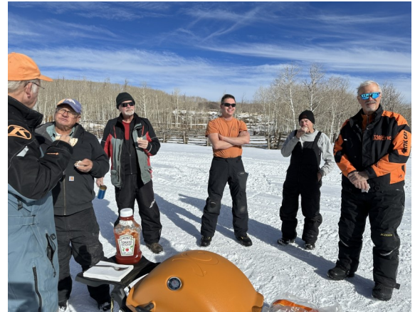
Parking Lot Bar-b-que