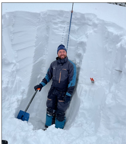
Members enjoying March Snow!